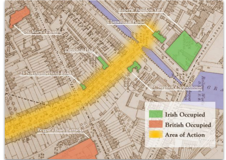
Northumberland Road Higher to Mount Street Bridge. This is the main area where the battle took place.